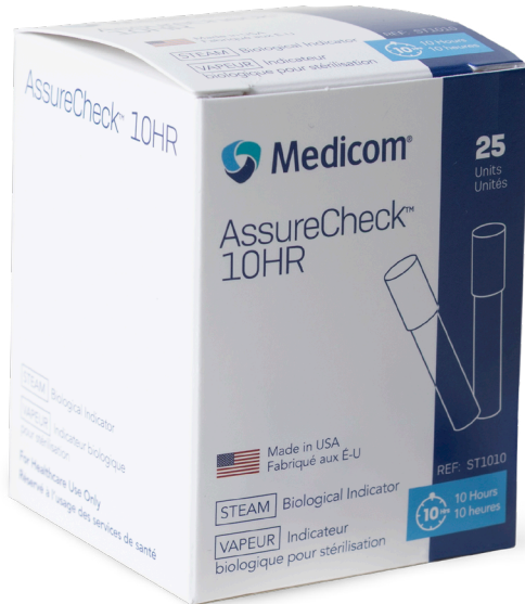
AssureCheck™ 10HR ST1010, 25 units/box; 6 boxes/case

Biological indicators (BIs) are the most accurate method for verifying that the conditions for sterilization have been met by confirming whether microorganisms have been killed during a sterilization cycle. For dental practices, this is critical in ensuring the safety of your patients and practice.