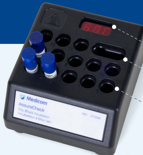
AssureCheck™ Dry Block Incubator ST1000, 1/box

AssureCheck™ Dry Block Incubator is lightweight, compact, and easy to use. Pre-programmed for optimal temperature and designed to work seamlessly with AssureCheck™ 10HR biological indicators, this incubator lets you take control of your sterilization monitoring process.